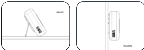
TABLE & WALL MOUNT (included with purchase)

The unit includes a built in table prop and comes equipped with two teardrop holes for mounting to a wall via ¼" screws.